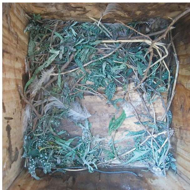
Figure 2. Nest box with the lichen Ramalina celsa that was used by some of the starlings at the beginning of nest building.

The presence of secondary metabolites in the specimens of R. celsa could not be confirmed by TLC because concentrations were below the lower detection threshold of the method. However, we observed an orange fluorescence at the tips of the laciniae when thalli were exposed to UV light (Huneck and Yoshimura, 1996). The